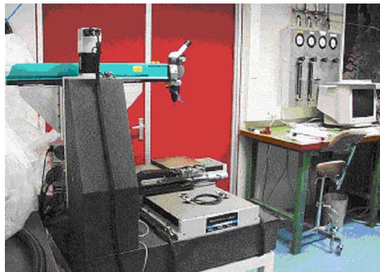
Laser machining, welding and engraving